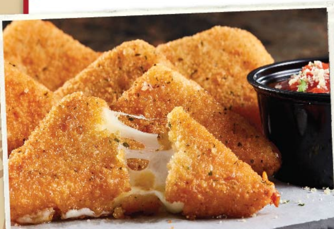
MOZZARELLA WEDGES: Six pieces of warm, melty goodness, with marinara to dip.