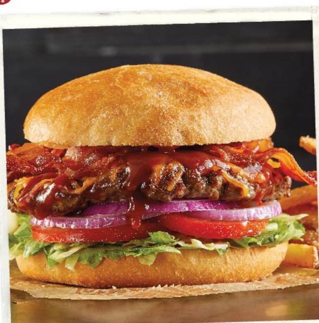
BBQ BACON CHEDDAR BURGER: From top to bottom, its name reads like a list of all the best things.

All handhelds are served with either coleslaw or French fries. Add a side salad for 2.29