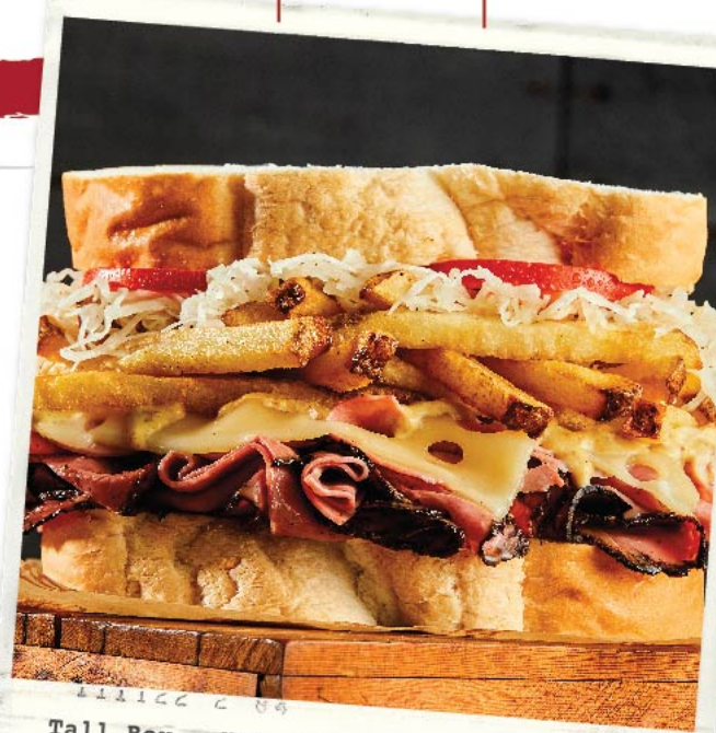
Tall Boy - New Yorker: Take an even bigger bite out of this favorite with pastrami, corned beef, Swiss cheese and spicy beer mustard.

Turkey, double bacon, and Swiss cheese; topped with Bacon Tomato Ranch sauce