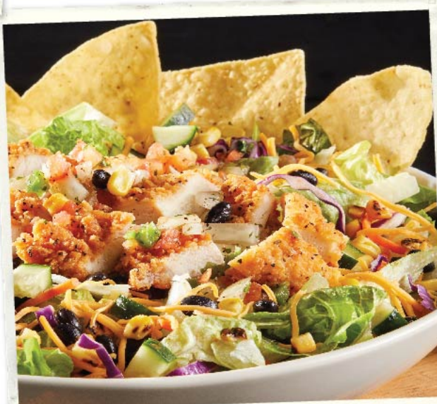
SOUTHWEST CRISPY CHICKEN SALAD: Light and refreshing. Zesty and colorful. Filling and satisfying.

DRESSINGS: Tuscan Gold Italian, Honey Dijon, White Balsamic Vinaigrette, Red Wine Vinaigrette, Ranch, Blue Cheese, Greek, Chipotle Ranch (Extra dressing additional 75¢)