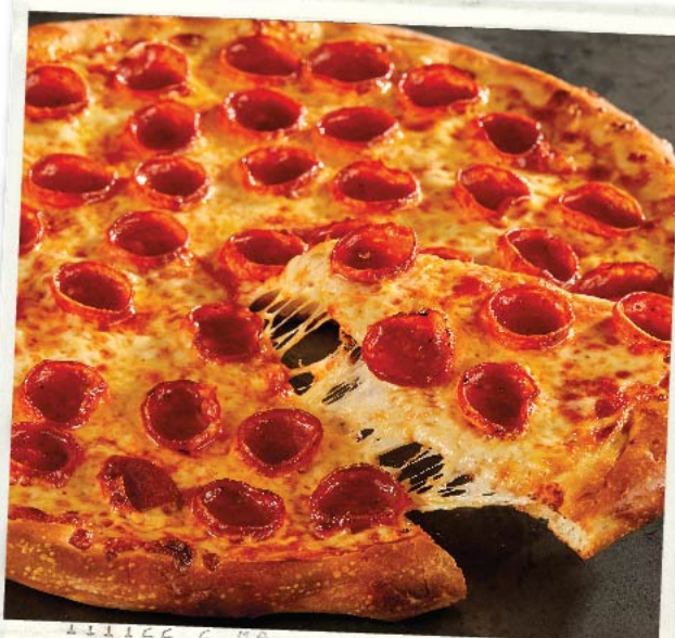
PRIMANTI BROS. PIZZA: To some people we're known first as a neighborhood place to get pizza. We're not gonna argue.

FRESH DOUGH • HOMEMADE SAUCE • WHOLE MILK MOZZARELLA