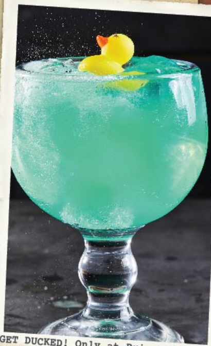
GET DUCKED! Only at Primanti Bros.

Simply a classic. Vodka, rum, tequila, gin, triple sec, sours and Coke