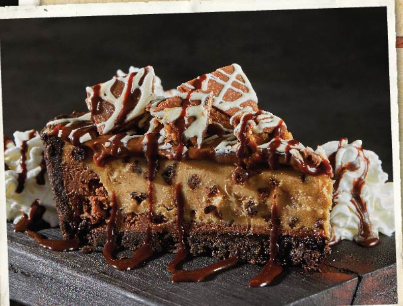
REESE'S: There's no wrong way to eat pie.

Giant brownie and real ice cream; topped with whipped cream and Hershey's chocolate syrup