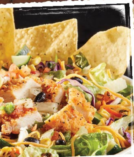
SOUTHWEST CRISPY CHICKEN SALAD: Light and refreshing. Zesty and colorful. Filling and satisfying.

Add cheese or onions for 50¢; Add sour cream for 75¢