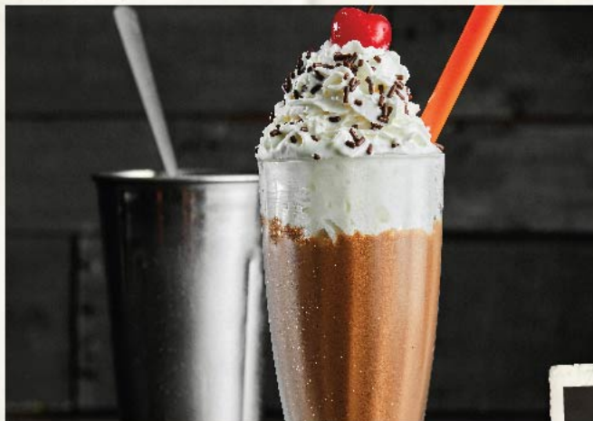
Real. Awesome. For everyone.

Real ice cream handspun with Three Olives Salted Caramel Pretzel Vodka, caramel sauce, pretzel bits and topped with whipped cream and caramel