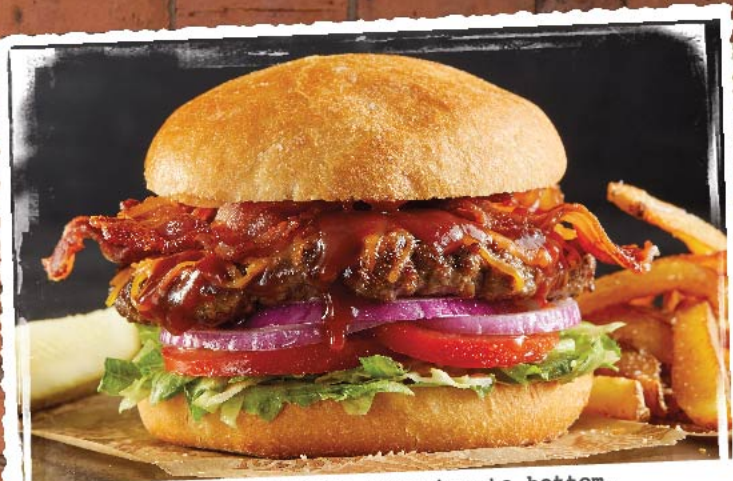
BBQ BACON CHEDDAR BURGER: From top to bottom, its name reads like a list of all the best things.