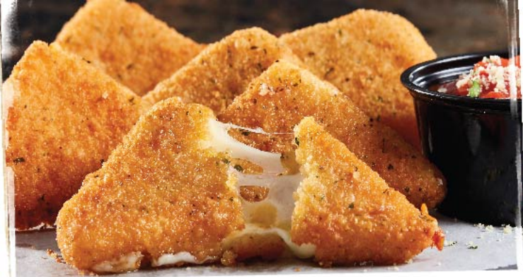
MOZZARELLA WEDGES: Six pieces of warm, melty goodness, with marinara to dip.

Fresh tortilla chips, fresh pico de gallo and queso