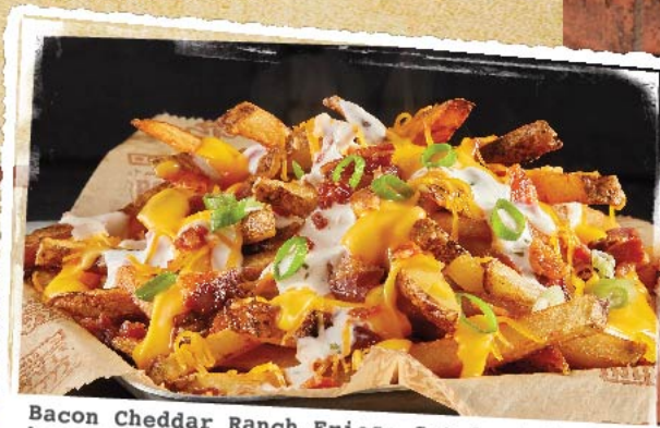
Bacon Cheddar Ranch Fries: Get loaded with bacon, cheddar cheese and Bacon Tomato Ranch sauce piled high on fresh-cut fries.